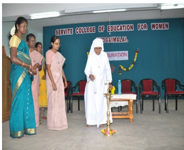
Independence Day on 15/08/15